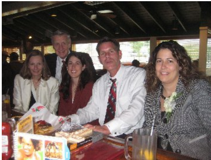
I talked so much I forgot to eat at the brunch, so it was off to Chili's.