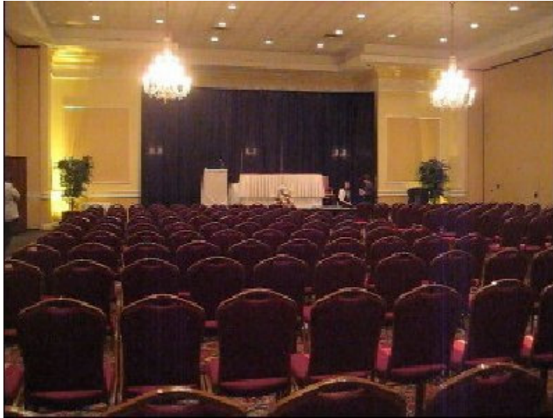
Our chapel for the day!