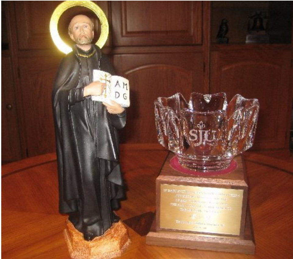
For those who heard my speech...