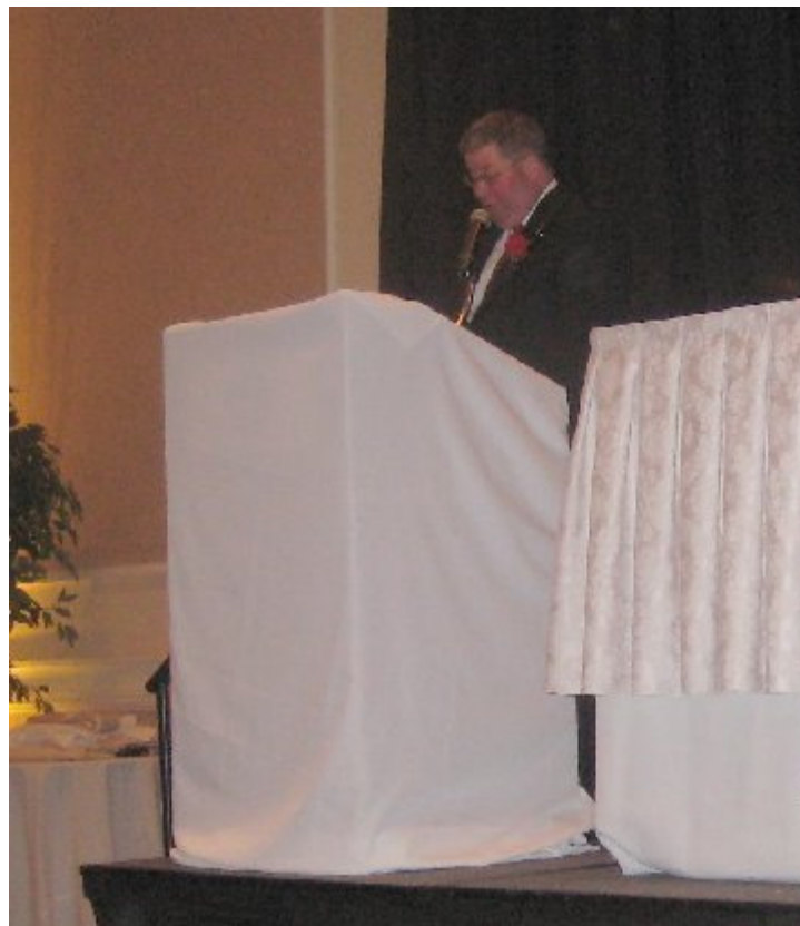
'81 Hawk at the podium